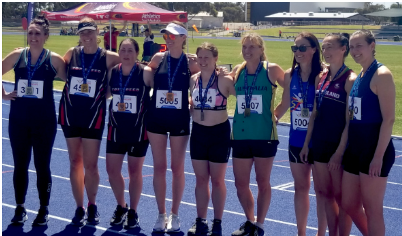
Pentathletes are all Smiles

The 2023 Australian Masters Games was held in Adelaide, with the athletics discipline held between October 7-11. The atmosphere was a really fun and relaxed vibe, but the event was held in a professional and punctual manner. I was proud to go over with my peers, representing team WA.