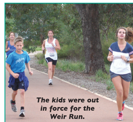
The kids were out in force for the Weir Run.