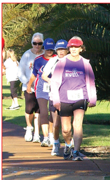
Our synchronised walk team are in serious training for 2016.